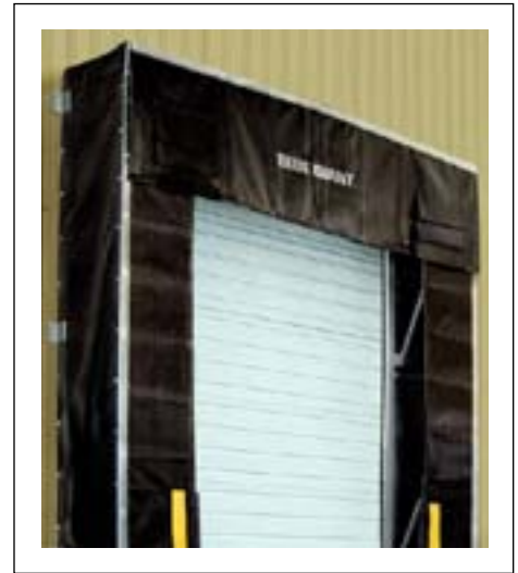
BGDSHR Retractable Dock Shelter